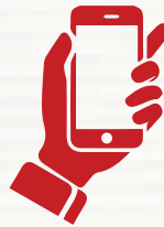
Editing and shooting using different mobile editing apps.