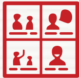
Story Board creating